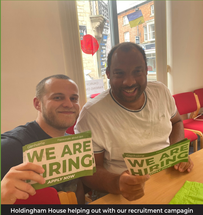
Holdingham House helping out with our recruitment campaign

Glenholme Healthcare is always looking for passionate, kind, and caring individuals who are willing to support our wonderful clients. You will be promoting independence, choice, and inclusivity. With care ranging from normal day-to-day activities to full physical and psychological care for persons nearing the end of their lives. Don't miss this fantastic opportunity and apply to Glenholme today.